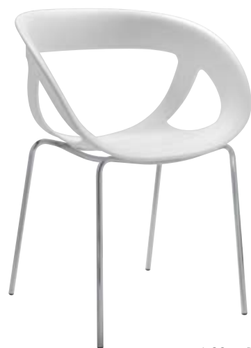
cod. 69.-- /NA