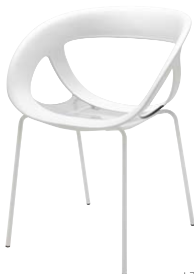
cod. 76.-- /NAB